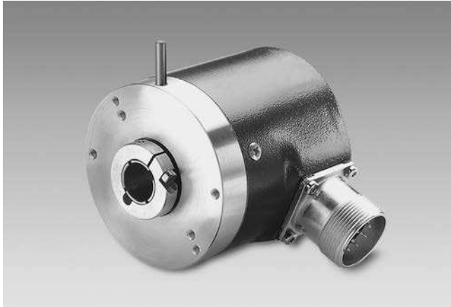
GBA2S with blind hollow shaft