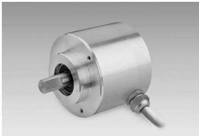
GE355 with clamping flange