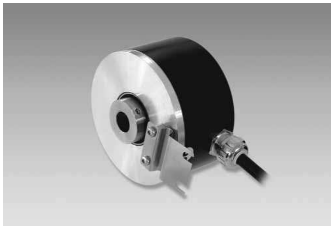
ITD 42 A 4 with blind hollow shaft