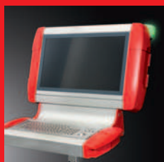
Enclosure technology – Function and design