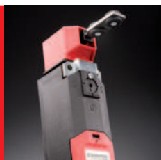
Switch technology – Economy meets safety