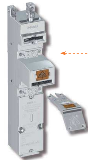
Example: STS-Unit SX01A