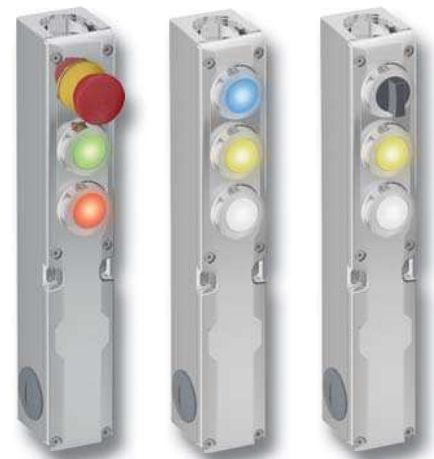
Option module TTN / TTT / TTW

The image displays a system with multiple access points. Before releasing the main access using the locking unit, the release button on the option module must be pressed. This ensures that the machine or system moves into a safe position. Only then it is possible to open the main access and maintenance doors. Only once the protective doors have been appropriately closed and the key is back in the locking unit can the system be re-started using the two release buttons. The option module can also be integrated into system controls as a stand-alone control unit, in order to outfeed faulty parts, for instance, or adapt processing speeds.