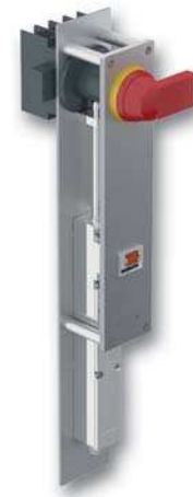
SAFEMASTER STS Power Interlocking ZRH01SLPR40