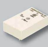
OA 5642 OA 5643 OA 5644