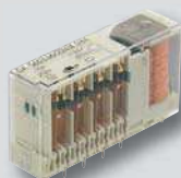
OA 5601 OA 5602 OA 5603