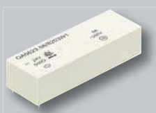
OA 5621 OA 5622 OA 5623