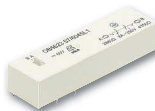
OB 5623 With manual activation