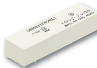
OB 5623 Without manual activation