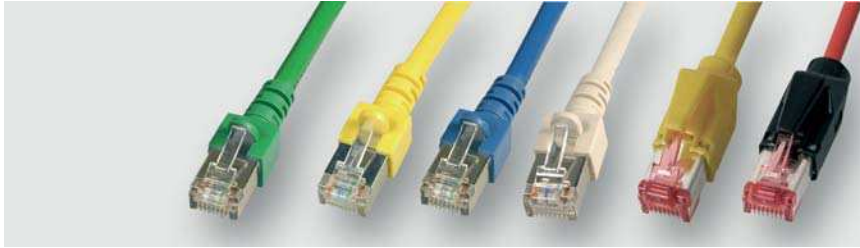
Patch cable, shielded