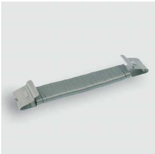
Spring shield clamp