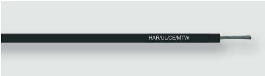
Flexible Single Conductor Hook Up Wire · Multi-Norm