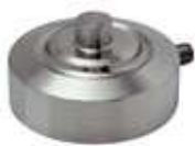
F13C1 Compression transducers

At tecsis you will find a comprehensive range of products. Our force transducers with thin-film technology or standard strain gauges are approved for use in hazardous zones.