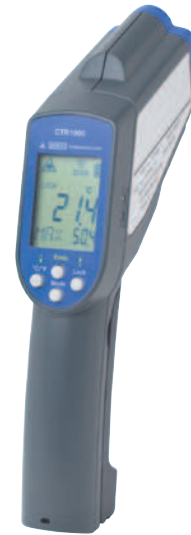
Infrared hand-held thermometer model CTR1000