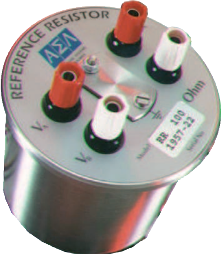
Reference resistor, model CER6000-RR with 100 Ω