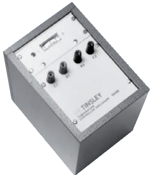
Thermal enclosure for CER6000-RW resistors, at a fixed temperature of 36 °C