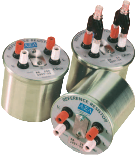
Model CER6000-RR reference resistors with different resistance range