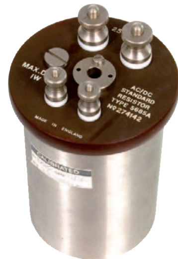
Standard reference resistor, model CER6000, 10 Ω