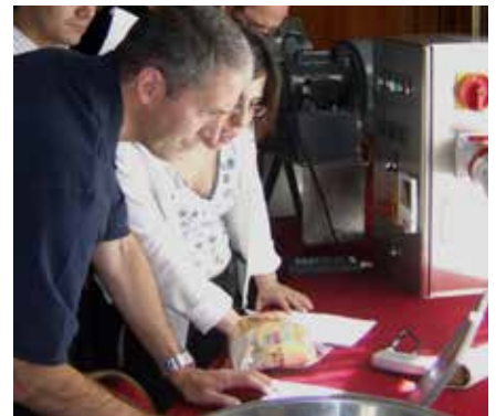
Benchtop testing may be performed in our lab or at a customer's facility.