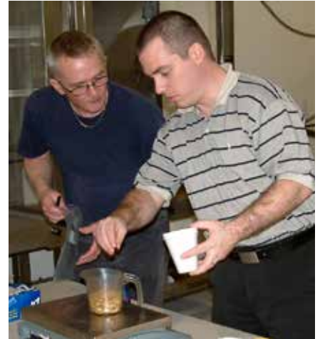
Product development begins with lab trials to obtain test data.

The continuous lab dryer is capable of pilot scale product testing in several configurations including dual impingement, through-air and fluidized bed. In addition to testing at the Bühler Aeroglide lab, customers may lease the lab dryer or other equipment for use at their facility.