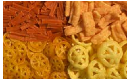
Snack pellet products before and after expansion at the Bühler Aeroglide Technical Center.