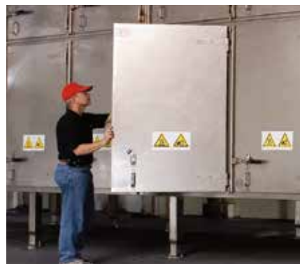
Since its inception, Bühler Aeroglide's Field Engineering group has conducted over 1300 detailed dryer evaluations.

Satisfaction Guaranteed. If you are not completely satisfied with your dryer evaluation, Bühler Aeroglide will rectify all concerns (returning to your site if necessary) or void all charges. For more information, or to request an evaluation, call +1 919 851 2000 or send an e-mail to aeroglide.training@buhlergroup.com .