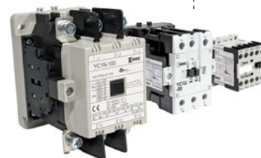
Contactors & Motor Starters