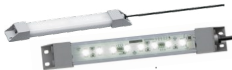
LED Machine Lighting