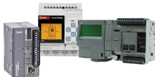
Programmable Logic Controllers