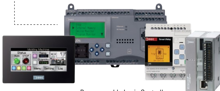
Programmable Logic Controllers