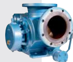
HC/VHC high capacity pump