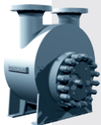
MPC multiphase pump compressor