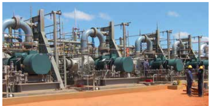
Nearly 80 pumps in operation

Low to very high viscosity oil products such as bitumen, tar, chemicals, light and heavy fuel oil, mazut and storage water.