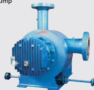
HP high pressure pump