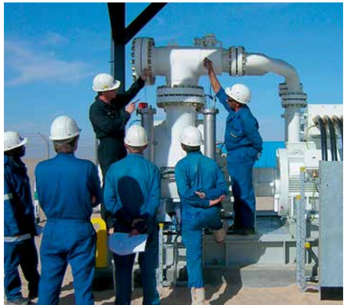
Quality service guarantees your investment