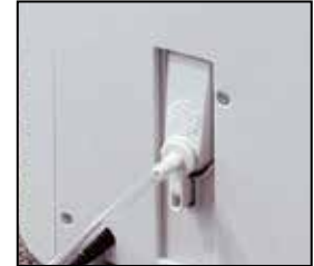
Built-in drain pump in models D50BP and D70BP.