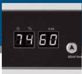
Displays room temperature and humidity %.