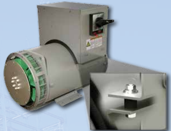
Vibration Isolated conduit boxes, gasketed for environmental protection.

Constructed for extended life by utilizing Marathon's exclusive unirotor construction, UL1446 Recognized Class H insulation system, and long life bearings. MAGNASELECT ™ designs are the ideal general purpose generators for your prime power markets as well as your emergency power needs.