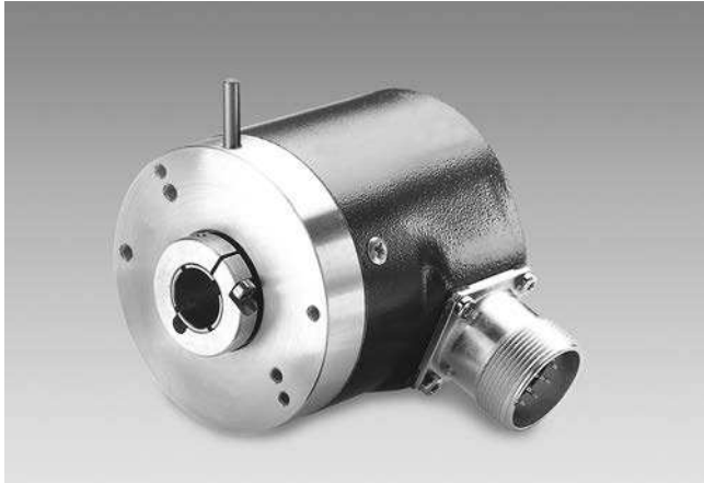
G0P5H with through hollow shaft