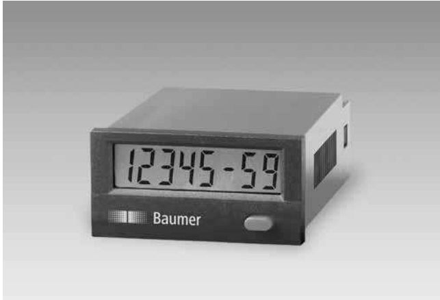
ISI34 - Hour counter