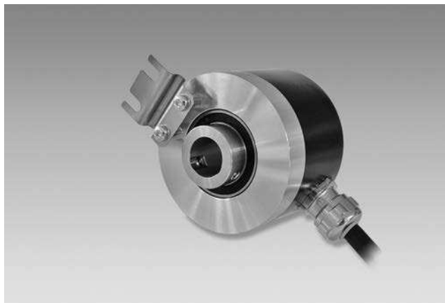
ITD 20 A 4 with blind hollow shaft