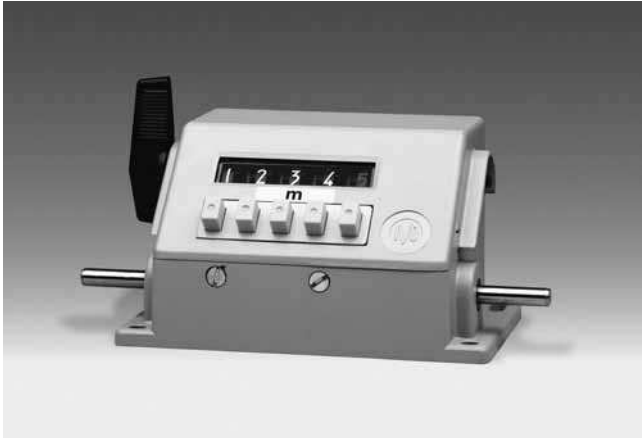
ME230 - Meter counter