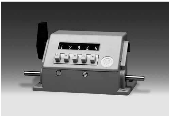
UE230 - Revolution counter