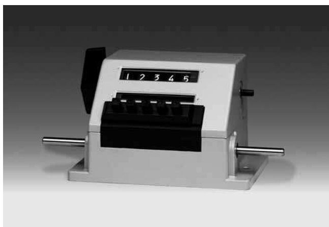
UE280 - Revolution counter