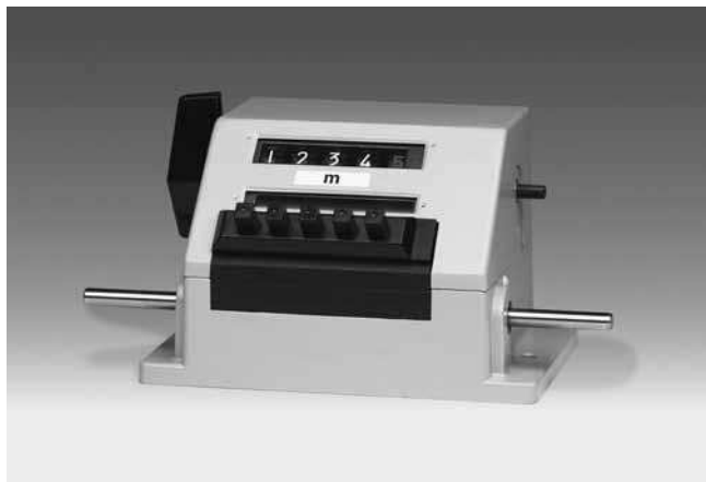
ME280 - Meter counter