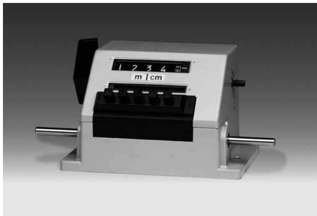
ME282 - PTB Meter counter