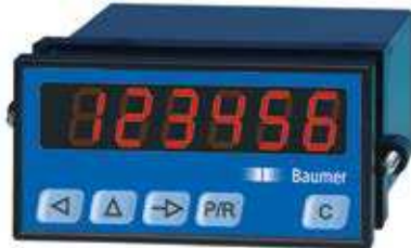
PCD41 - Process display