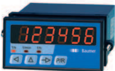
TA200 - LED tachometer