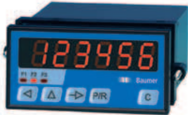
TA201 - LED tachometer