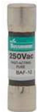
250Vac 1/4 to 30A