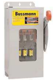
CF_ Quik-Spec™ Safety Switch disconnect (optional window). Data Sheet 1156

The only controlled copy of this Data Sheet is the electronic read-only version located on the Cooper Bussmann Network Drive. All other copies of this document are by definition uncontrolled. This bulletin is intended to clearly present comprehensive product data and provide technical information that will help the end user with design applications. Cooper Bussmann reserves the right, without notice, to change design or construction of any products and to discontinue or limit distribution of any products. Cooper Bussmann also reserves the right to change or update, without notice, any technical information contained in this bulletin. Once a product has been selected, it should be tested by the user in all possible applications.