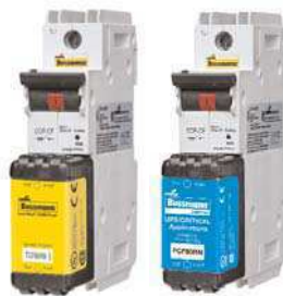
CCP_CF 1-, 2- & 3-Pole switched disconnects Data Sheet 1157