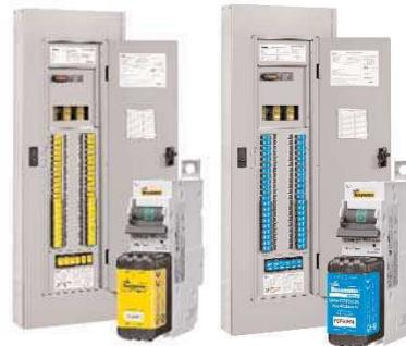
CCPB 1-, 2- & 3-Pole disconnects for the Quik-Spec™ Coordination Panelboard. Data Sheet 1160