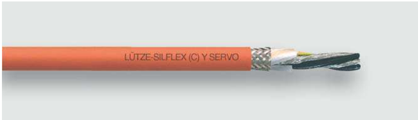
PVC servo cables · shielded