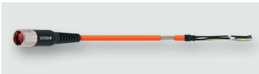
Single Cable Assemblies for C-tracks