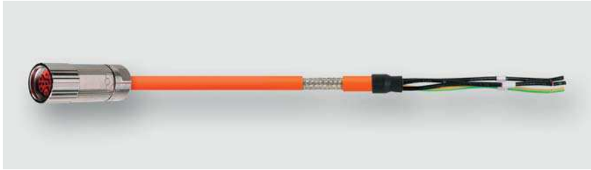
Servomotor Cable Assemblies for C-tracks