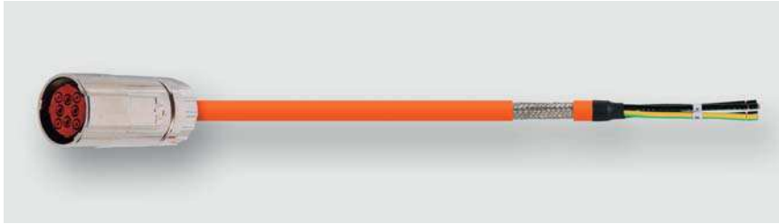
Servomotor Cable Assemblies for C-tracks