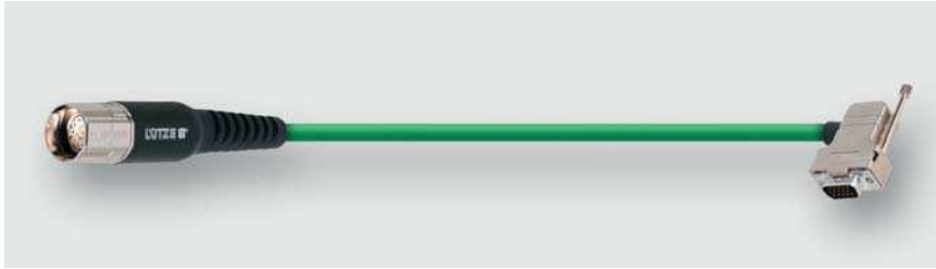
Signal Cable Assemblies for C-tracks