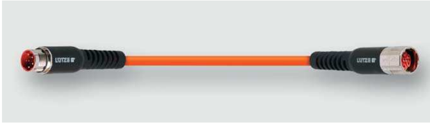
Servomotor Cable Assemblies for C-tracks