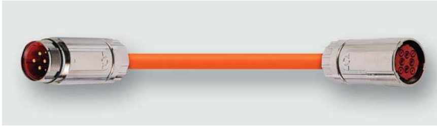
Servomotor Cable Assemblies for C-tracks