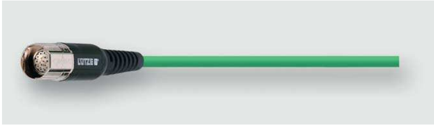
Signal Cable Assemblies for C-tracks