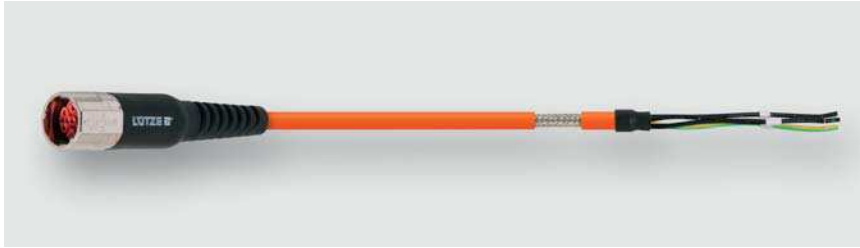
Servomotor Cable Assemblies for stationary applications