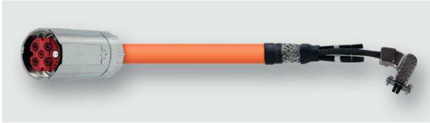
Single Cable Assemblies for C-tracks