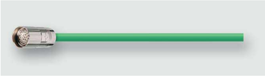
Signal Cable Assemblies for C-tracks