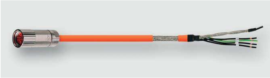
Servomotor Cable Assemblies for C-tracks