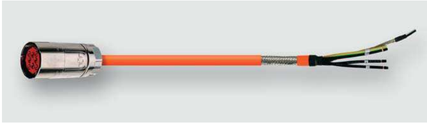
Servomotor Cable Assemblies for C-tracks