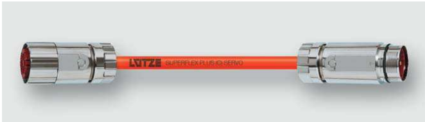
Servo cable assemblies with bra- ke pairs for C-tracks