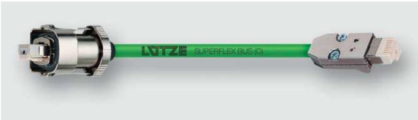
Signal cable assemblies for fixed installation