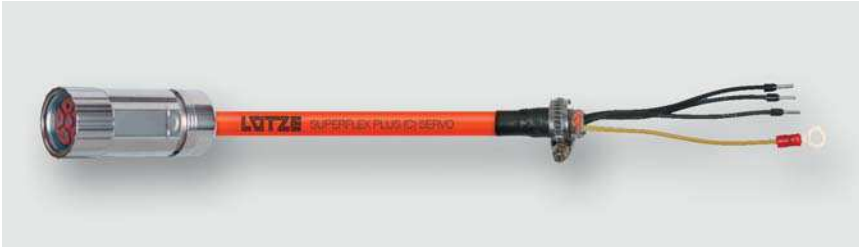
Servo cable assemblies without brake pairs for C-tracks