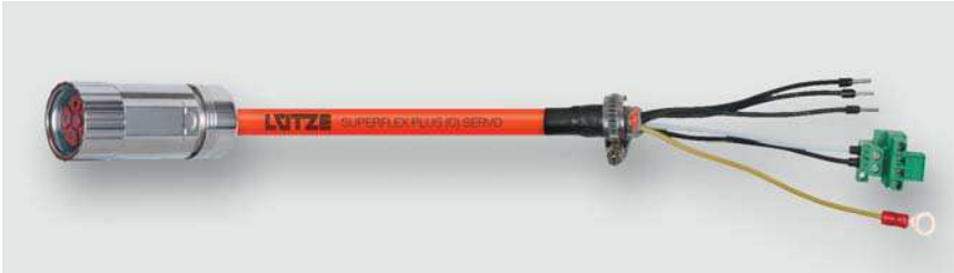
Servo cable assemblies with brake pairs for C-tracks