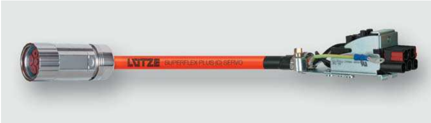
Servo cable assemblies with bra- ke pairs for fixed installation