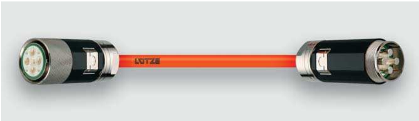
Servo cable assemblies with bra- ke pairs for fixed installation