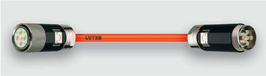
Servo cable assemblies with bra- ke pairs for C-tracks